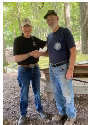
The 2 Rons Making this all happen with a lot of great volunteers