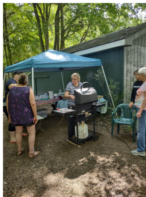
The Kitchen Crew did a great job.