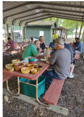
The Brats and Sloppy Joes were great AS USUAL !