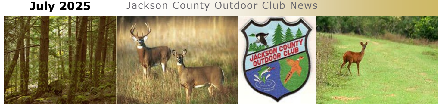
Inside this issue: