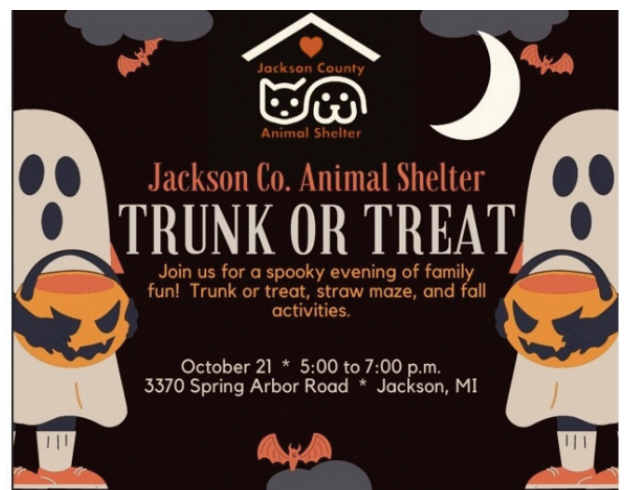
Jackson County Animal Shelter is hosting a Trunk or Treat at their location at 3370 Spring Arbor Rd., Jackson, MI. It will take place on Saturday, October 21, from 5-7 pm. There will be a Trunk or Treat with candy, straw maze and other fall activities! Come join the fun!