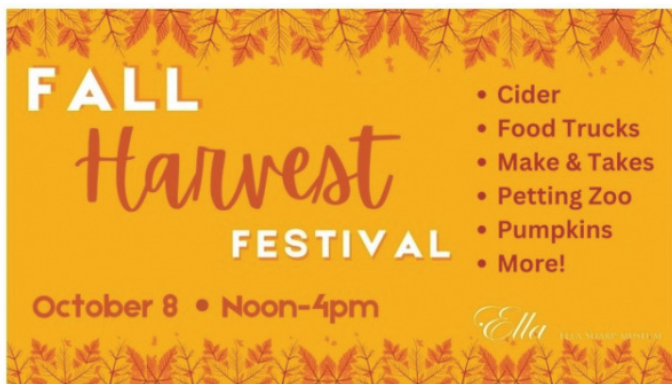
Ella Sharp Museum Fall Harvest Festival 3225 4th St, Jackson, MI. Join the festivities! Price: Free Admission to Farm Lane!

TRACKS is written for 4th-6th grade learners, but there are animal facts, information and pictures that will connect with all age groups. For just $20 you can have 8-issues of this fantastic youth-focused wildlife magazine delivered directly to your house! For information visit: https://mucc.org/tracks-magazine/